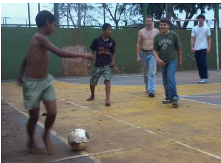
The Brazilians teach the Americans a little thing about soccer.