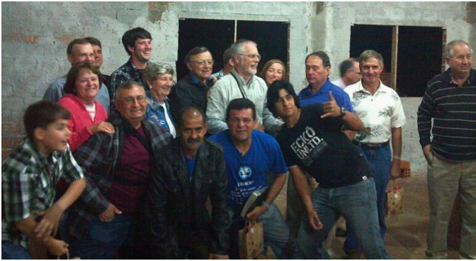
Our crew and the “brothers” enjoying each others fellowship.

I remind you again that this all transpired in a native tongue and we had no interpreter present. Yet everyone experienced the worship that flowed out of that gathering. I have said before, that sometimes when you take the language out of worship, there is another level of worship that can be experienced. I was beginning to believe this to be a personal experience, but this event reinforced